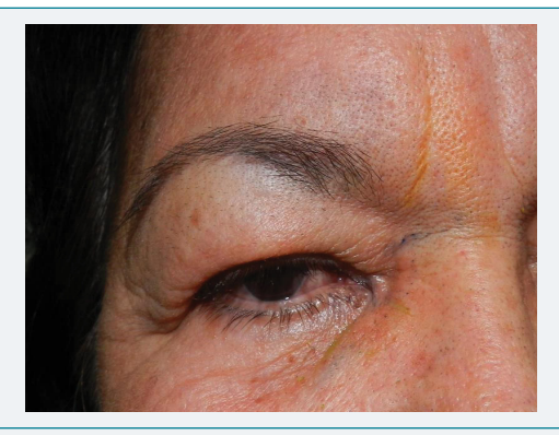
Figure 1: Lesion of the right canthal medial region.

A suitable bilobed flap is marked on the skin (Figure 2A) before the subcutaneous injection of bupivacaine 05% with 1:200.000 epinephrine and then apply firm pressure for 5 minutes. The lesion is then excised with 3 mm security margins and sent for pathology to verify clear margins (Figure 2B). The flap boundaries are cut, dissected and mobilized with blunt scissors beneath the flap and across the dorsum of the nose. The primary lobe is then elevated, rotated and positioned in the defect to confirm that the size of the flap approximates of the defect. Three deep invert Vicryl (polyglactin 910; Ethicon) sutures are placed to position the flap with minimal tension (Figure 2C). While, 7/0 Prolene (polypropylene; Ethicon) sutures are placed to close the epidermis in simple fashion (Figure 2D,2E). A bolster is applied over flap to push the skin gently against the recipient bed. The sutures are removed in 10 days and topical ointment is applied twice daily .Histological examination revealed un BCC with a separate focus of infiltrative tumor, confirmed that the margin was free of tumor. The patient has been followed up for 1 year with no evidence of recurrence and has no concerns with eyelid function, visual field and epiphora (Figure 3).